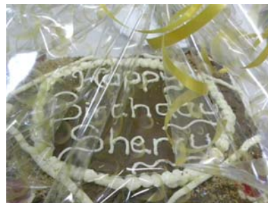
Other things to Celebrate