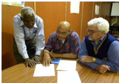
The Assignment—Team 1