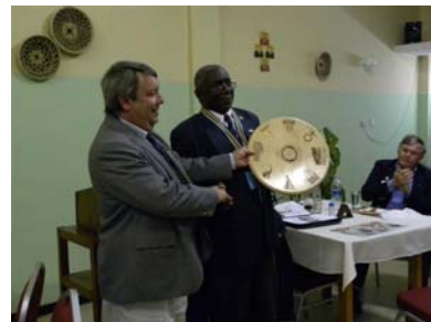
Gift from the Club