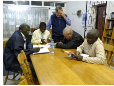
The Assignment—Team 2