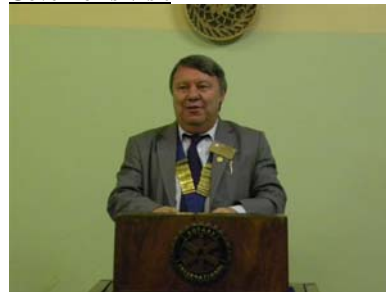
Addressing the Club