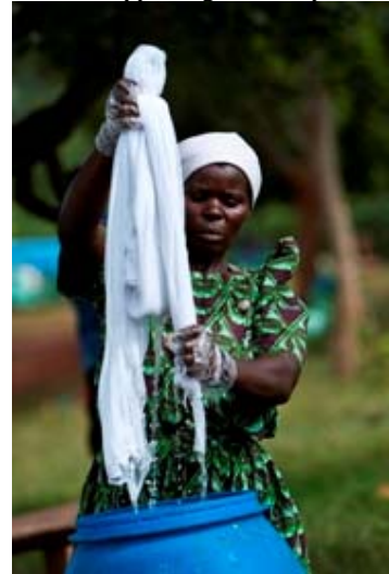
Above: A volunteer dips mosquito nets into insecticide treatment to prepare them for use.

Read about nongovernmental and Rotarian-sponsored organizations that are supporting malaria prevention projects.